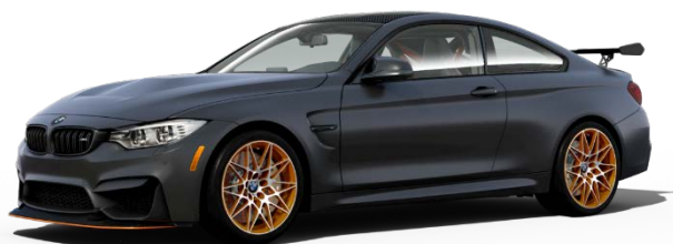
Frozen Dark Grey